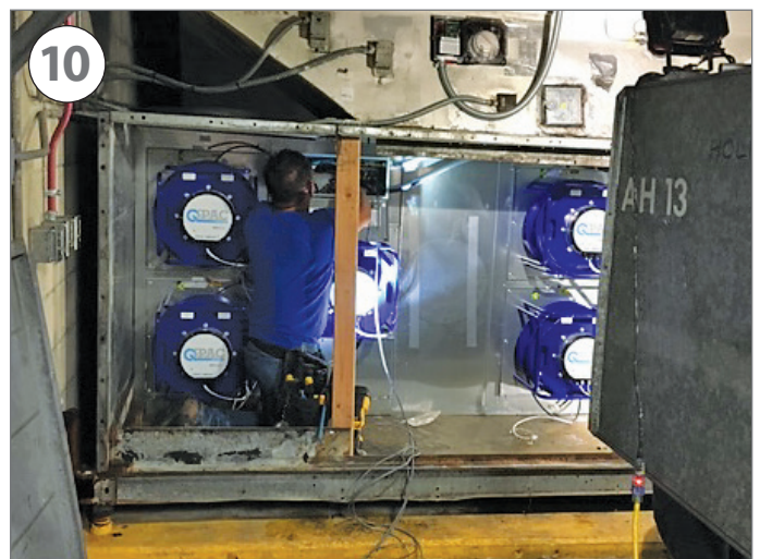
Q-PAC Fan Installation