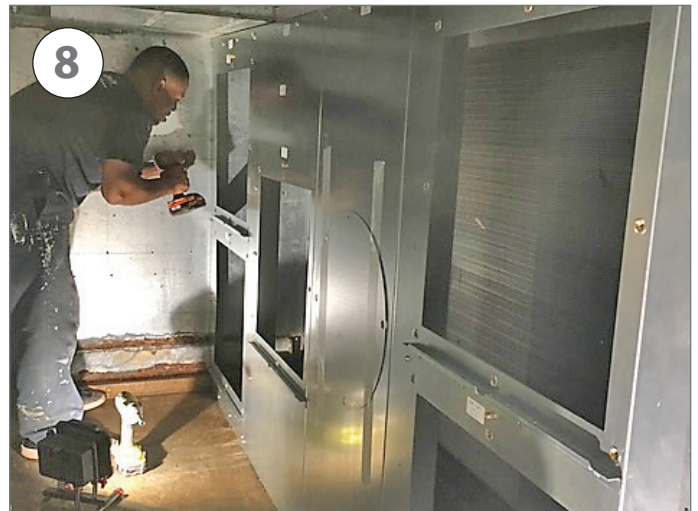
Q-PAC Fan Wall Installation