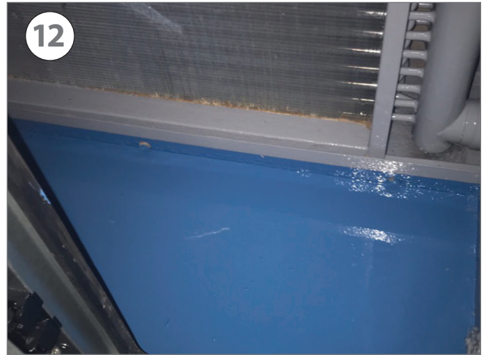
Drain Pan After Pure-Liner 2.0