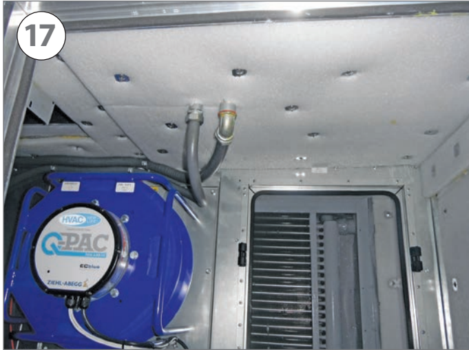
Pure-Cell With Fans