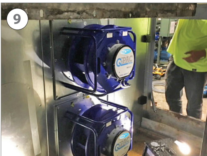
Q-PAC Fan Installation