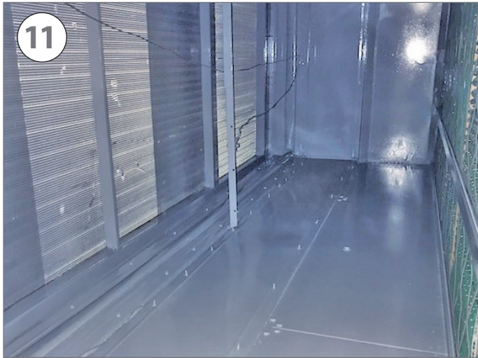
Interior Plenum After Pure-Coat