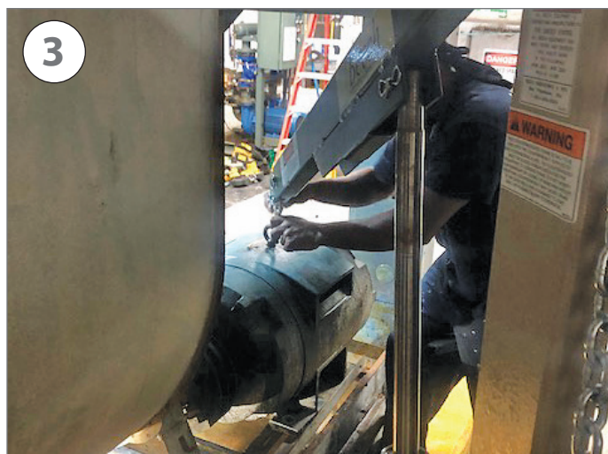
Old VFD Blower Motor Removal