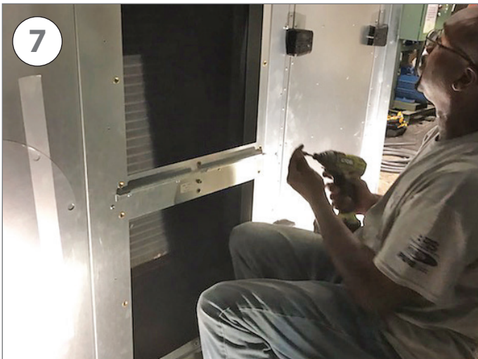
Q-PAC Fan Wall Installation