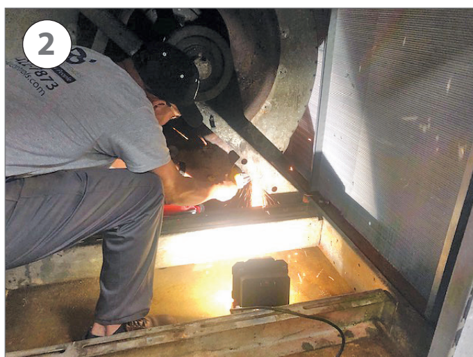
Old Blower Removal