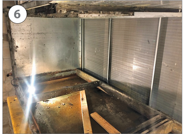
AHU Interior Prep