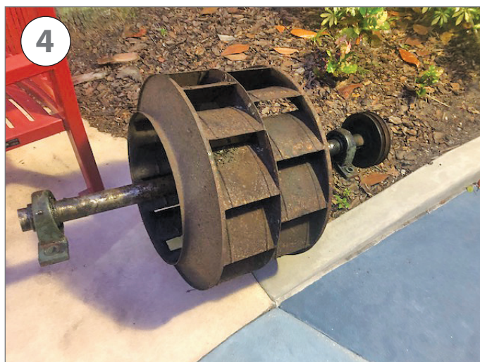
Old Blower Wheel Removed

SMouton@AcadianaFilters.com 2505 Jane St., New Iberia, LA 70563