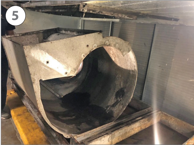
Old Blower Housing Disassembled